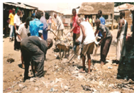
A clean up exercise by community members at the Bangladesh slum

The seed project started early morning at the entrance of the Bangladesh slum in Changamwe, Mombasa by the Miritini ACK Church.