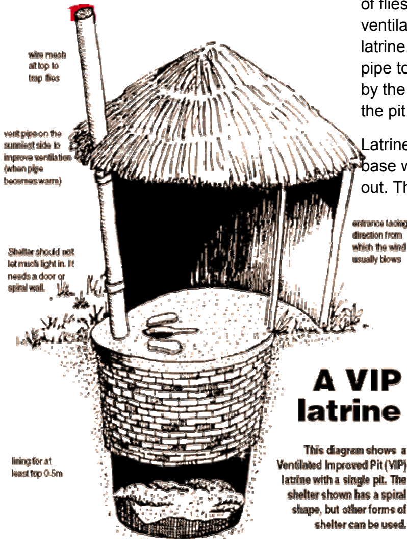
This diagram shows a Ventilated Improved Pit (VIP) latrine with a single pit. The shelter shown has a spiral shape, but other forms of shelter can be used.

The pit can be lined or reinforced with different materials: bricks, blocks, stones, an oil drum, or bamboo, for example.